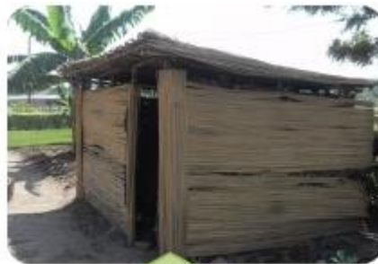
Igisharagati cya mpandeye cyubakishije ibibambano by`urufunzo