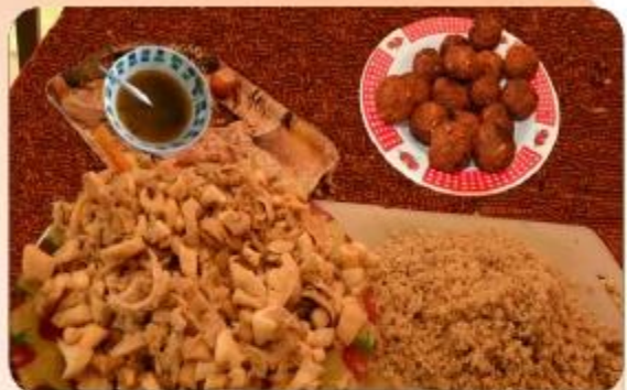
Isosi na boulettes z` ibihumyo

Ibihumyo bifasha izindi ntungamubiri gukora neza akazi kazo.