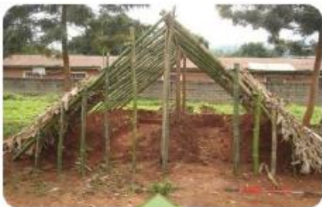
Igisharagati cya mpandeshatu cyubakishije imigano n`amashara ariko kitaruzura

Mu kubaka igisharagati si ngombwa gukoresha ibikoresho bikomeye cyane cyangwa se bihenze. Igikenewe ni ubuhere umwuka n`urumuri biringaniye. Cyakora ni byiza ko igisharagati kiba kitava kugira ngo ibihumyo bitangirika mu gihe cy`imvura. Igisharagati gishobora kuba mpandeshatu cyangwa se mpandeye .