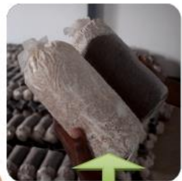
Umugina wuzuye uri kumwe n' utaruzura

Uburwayi ku mugina bugaragazwa n'ibara ry' icyatsi cyangwa se iry' umukara . Umugina ufite aya mabara umuhinzi akwiye kuwirinda kuko unawuteye utakwera ibihumyo