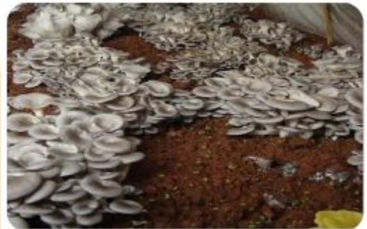
Umurima w'ibihumyo bya Pleurotus ostreatus

Buroroshye guhinga, Buhingwa mu butaka, Ntibusaba ikoranabuhanga rihambaye, Ntibusaba ubutaka bunini kuko no kuri metero kare imwe hahingwa, Ibikoresho bikenerwa mu kubuhinga biboneka hose mu Rwanda ku buryo bworoshye, Umusaruro wabyo urashimishije:ku mugina umwe hashobora kweraho hagati ya 600g- 1Kg, Ibihumyo byerera igihe gito cyane: hagati y'iminsi 7-10 uba utangiye gusarura, kandi ukamara amezi 3-4 usarura ahantu hamwe mu bihe bitandukanye, Gutangira kubihinga ntibisaba amafaranga menshi, umuntun ashabora guhera ku mafaranga 50,000 gusa Ntubitwara umwanya munini mu kubyitaho, Ubihinze arunguka.