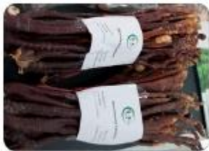
Ganoderma lucidum , ikunze gukoreshwa nk`umuti

Mu Rwanda hamaze kugezwa amoko menshi y` ibihumyo. Amwe yatangiye guhingwa andi aracyari mu bushakashatsi: